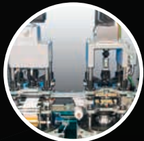
Multicolor Hotstamping etc.