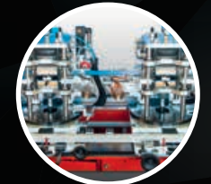
Many options for decoration