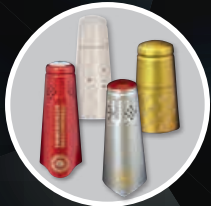
All capsule geometries and designs are possible

In its easiest form, the used capsules consist of a wound and glued skirt as well as a sealed top-disc. Materials used are printed or unprinted foil reels of crossstretched plastic, aluminium or complex foil and paper.