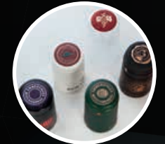
Capsules for all application